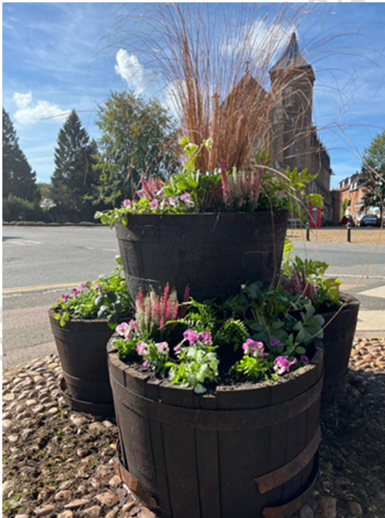
Winter Containers November 2025

Note: this report is all fictional and any resemblance to real life events is not intentional.