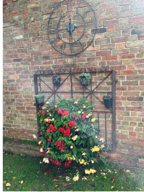
Manger on the Green Autumn 2025