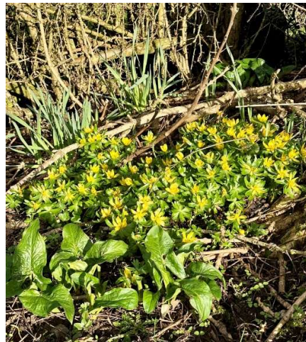
Winter Aconites March 2025