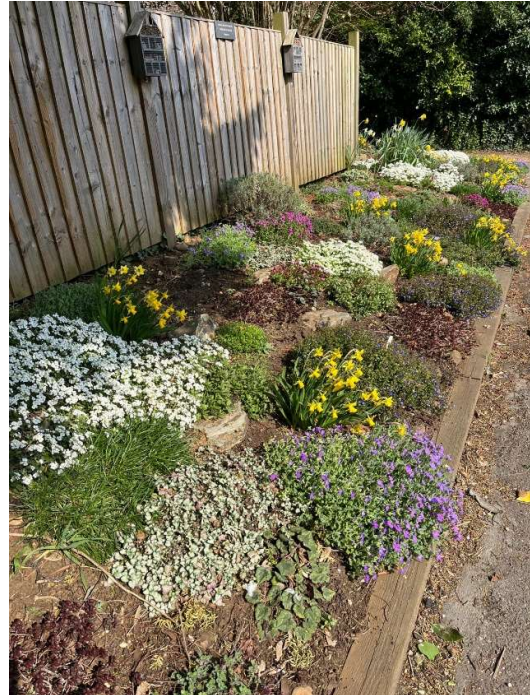
The Sensory Garden – summer 2025 , installed for the residents of Staunton House