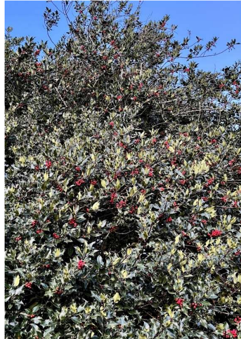
Holly hedge – November 2025

Recent developments include planting a flower border along the edge of one of the wildlife sites to encourage more pollinators and insects.