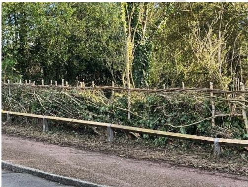
Layered hawthorn hedge in the village Spring 2025

The surrounding countryside has well-tended hedgerows including hawthorn, crab apples, elder and blackthorn, as well as large holly hedges. Local woodland has large bluebell and snowdrop patches. Veteran oaks are protected by local farmers. Increasingly, farmers are planting cover crops and rotating crops to improve the environment for wildlife.