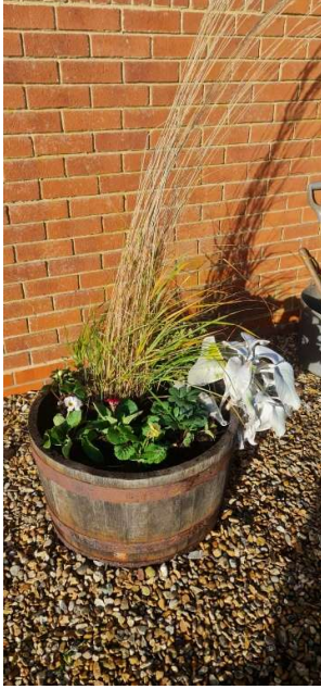
Winter container planting at the Village Hall November 2025