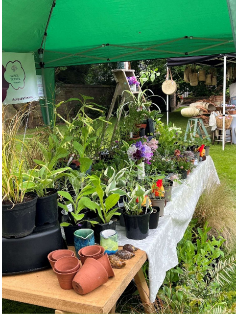
Plant stall June 2025