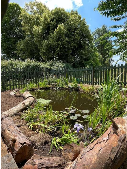
Newly built school allotment pond spring 2025