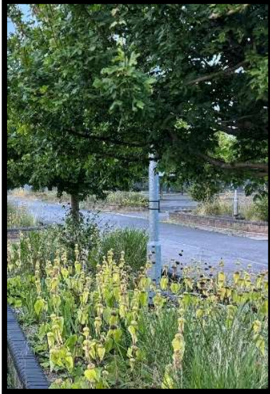
Drought tolerant planting in the carpark, July 2024