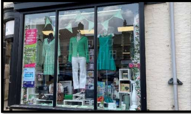
Local shops supporting Green Week with their window display, June 2025