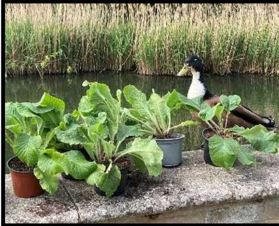
Where appropriate seasonal bedding is potted and moved to other areas in the town or sold to raise funds. March 2025

All of the plants are grown in peat free compost and the team have access to a shed where plastic pots are kept for reuse.