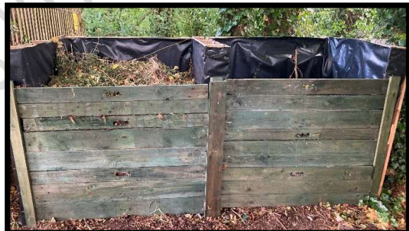
New compost bins behind the High Street. Used for all the organic waste. The resulting compost is used on the flower beds. April 2025