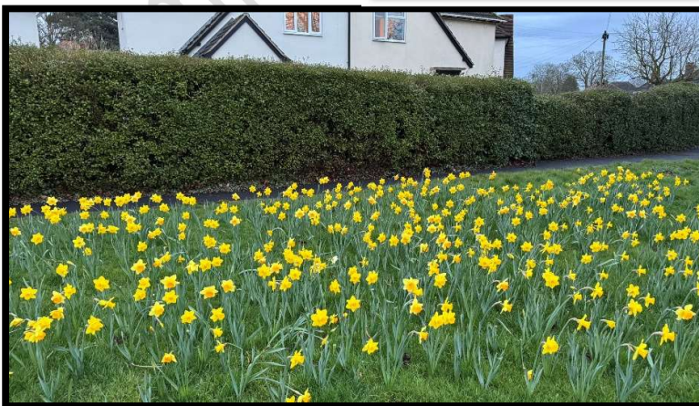
Over 10,000 daffodils planted since the group started, brightening up the town. February 2025