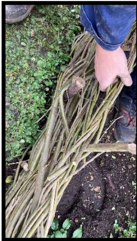
Woven willow fence to reduce vehicles driving over border in the town centre, January 2025

The Meadow Bottom volunteers look after the diverse habitat in the Meadow area where areas of the hazel woodland are coppiced on a rotational basis. The 'In Bloomers' assist with these tasks which are carried out in the winter.